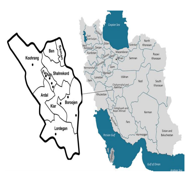
Figure. 2. Geographical Location of Chaharmahal and Bakhtiari Province and the Contaminated Spots.

parasites of most wild and domestic carnivores such as dogs and cats, respectively. It is estimated that there are over 600 million cats and 900 million dogs as stray and pet animals around the world, many of which may be infected with different parasites including gastrointestinal parasites. Therefore, these animals can defecate million tons of infected feces with discharge helminth eggs and protozoan cysts with zoonotic importance into the public environments every year. Despite efficient public health and hygiene promotion in different societies, many people such as gardeners, farmers, construction workers, and municipality staff, as well as toddlers and young children, may be exposed to contaminated soil based on occupational groups and behavioral characteristics such as playing in the parks as high-risk groups for toxocariasis.<sup>22</sup> The occurrence of Toxocara eggs in public parks is a matter of concern for public health.<sup>6</sup> The children with pica are at a higher risk of consuming infective eggs from the soil than those not